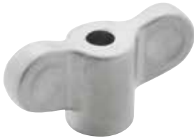
WN-NT-SUS (Tapped Through)