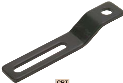
CRT (Crank Plate Tightener)