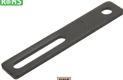
SRT (Straight Plate Tightener)