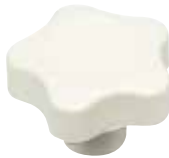
SFK (Brass Threaded Insert)