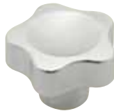
SFK-CR (Brass Threaded Insert, Chrome Plated)