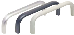
RD4-N RD4-B RD4-G