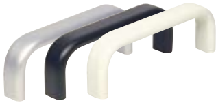
RD2-N RD2-B RD2-G