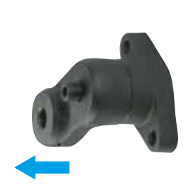
Pull the arm to disengage the teeth from the locking element.