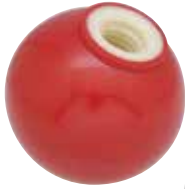
PB -R (Without Insert, Red)