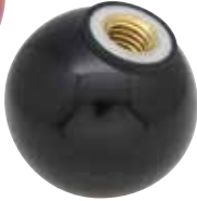
PC -B (With Insert, Black)