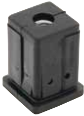
NDEQ25 -M10, M12