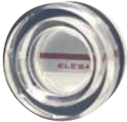
LE (Clear Body)