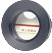
LG-N (Black Body)