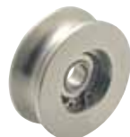
GRL-R-SUS (Stainless Steel)