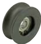
GRL-SH-R (Hardened Steel)