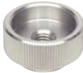
BJ750.**201N (Stainless Steel)