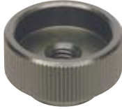
BJ750.**001N (Black Oxide)