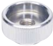
BJ750.**101N (Chrome Plated)